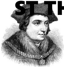
St Thomas More, pray for us!

This parish is part of the Catholic Archdiocese of Birmingham Registered Charity No. 234216