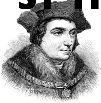
St Thomas More, pray for us!

This parish is part of the Catholic Archdiocese of Birmingham Registered Charity No. 234216